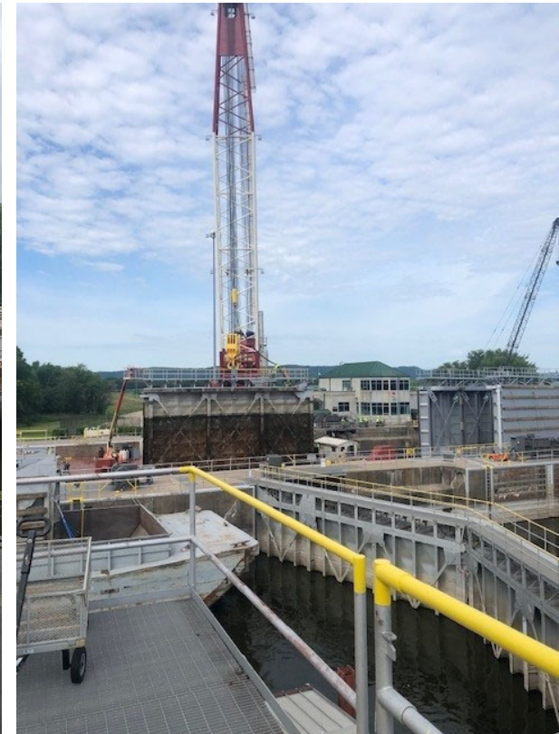
Left to Right: New miter gates awaiting placement (LD5A); Removing an old miter gate (LD5A).