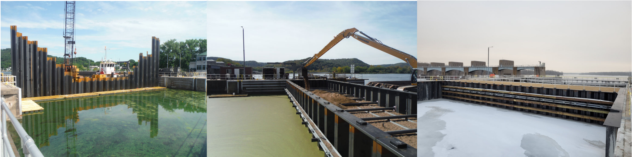
Left to Right: Driving piles for closure (LD6); Filling closure with aggregate (LD6); Finished closure viewed from upstream (LD10).