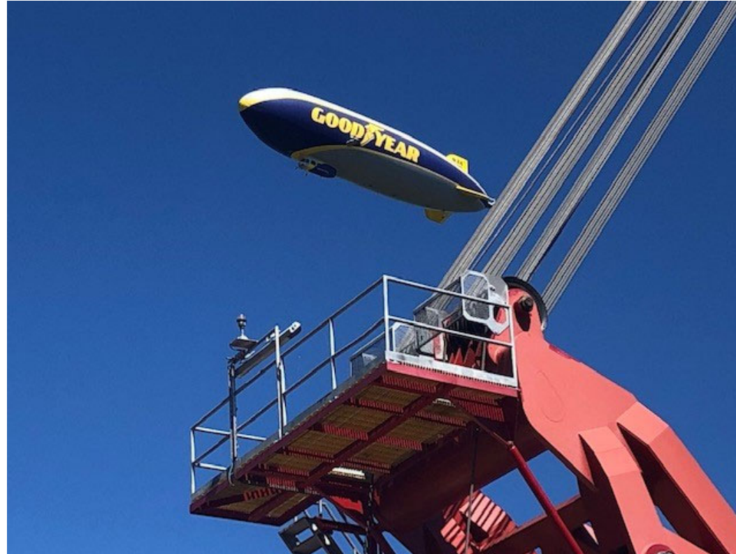
Goodyear blimp over LD5A