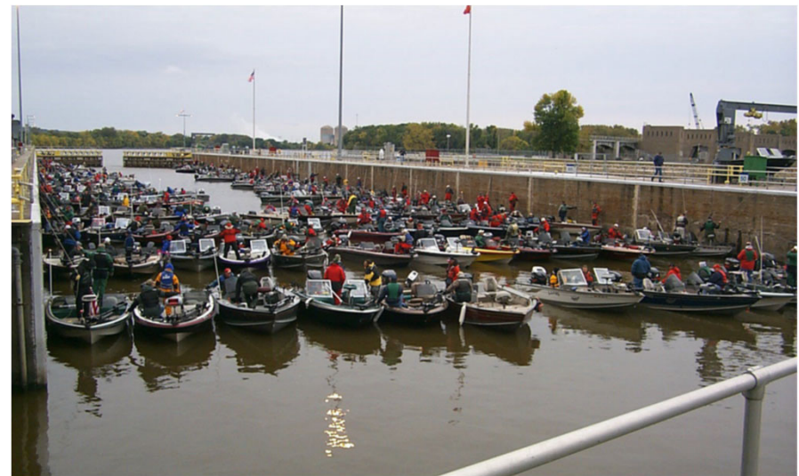
Highest rec #s in MVD