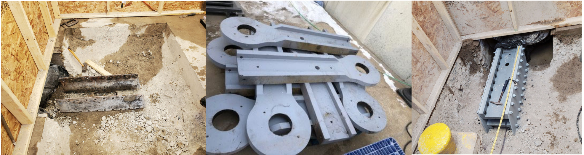
Left to Right: Existing gusset plate after concrete demo (LD4); New anchorage "lollipop" components; "Lollipops" installed to gusset plate, painted, waiting for concrete (LD4).